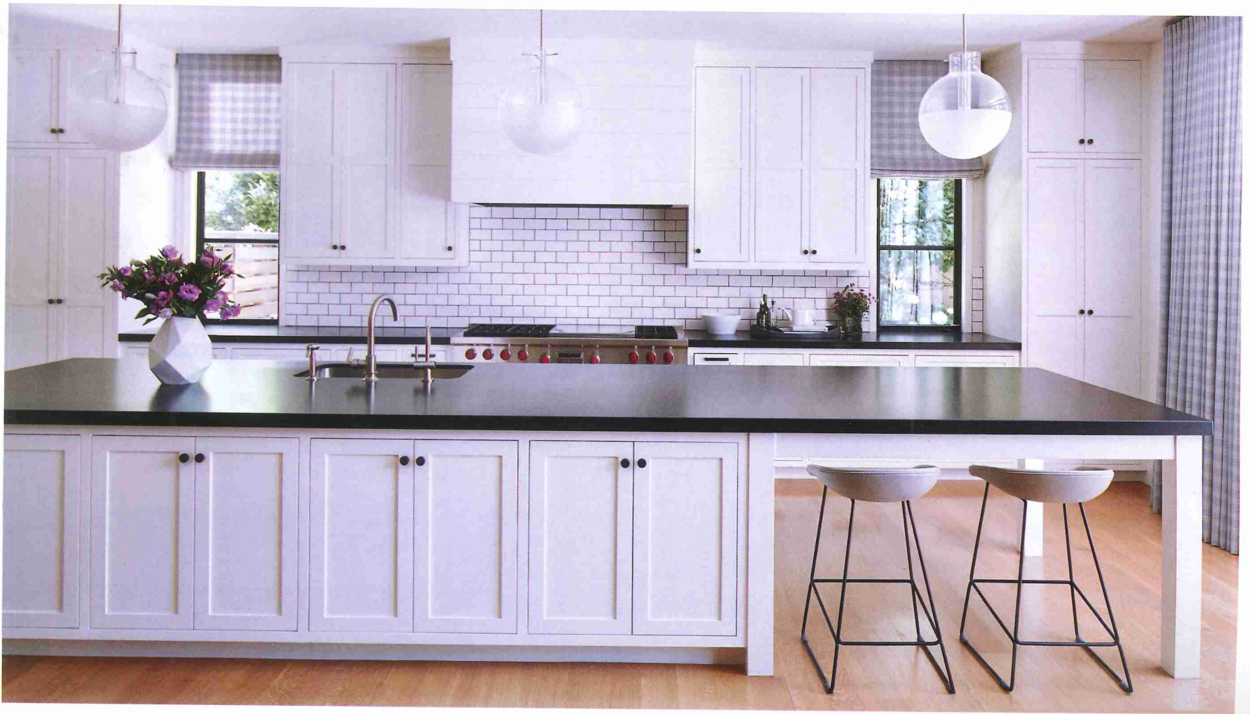
Sharp Seating (OPPOSITE PAGE) A Ted Abramczyk Cumulus pendant hovers above a Holly Hunt table. Ironies dining chair is upholstered in Jerry Pair leather. Rug is from Tai Ping America. Christopher Farr drapes are from De Sousa Hughes. Clean Palate (ABOVE) Nessen Lighting pendants are suspended above the kitchen island, where Hay bar stools deliver graphic impact. Gray Scale (BELOW) In the family room, a Holly Hunt sectional is from Kneedler | Fauchère. The Troscan coffee table features a sculptural steel base and a limestone top. Tuell and Reynolds side tables are made of cast bronze. Drapes are crafted from a Holland & Sherry wool. See Resources.